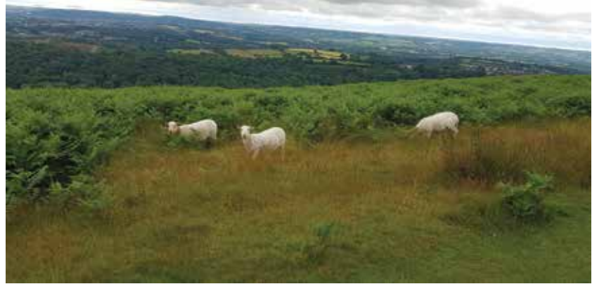
Sheep are not woolly dogs! Switching from a small animal to a large animal perspective was a steep learning curve

The pandemic has, on the other hand, created a surprisingly positive outcome from the perspective of the farm vets themselves. Some vet schools have scrapped the species minima requirement for clinical EMS as a result of the limited number of weeks in which to complete place-