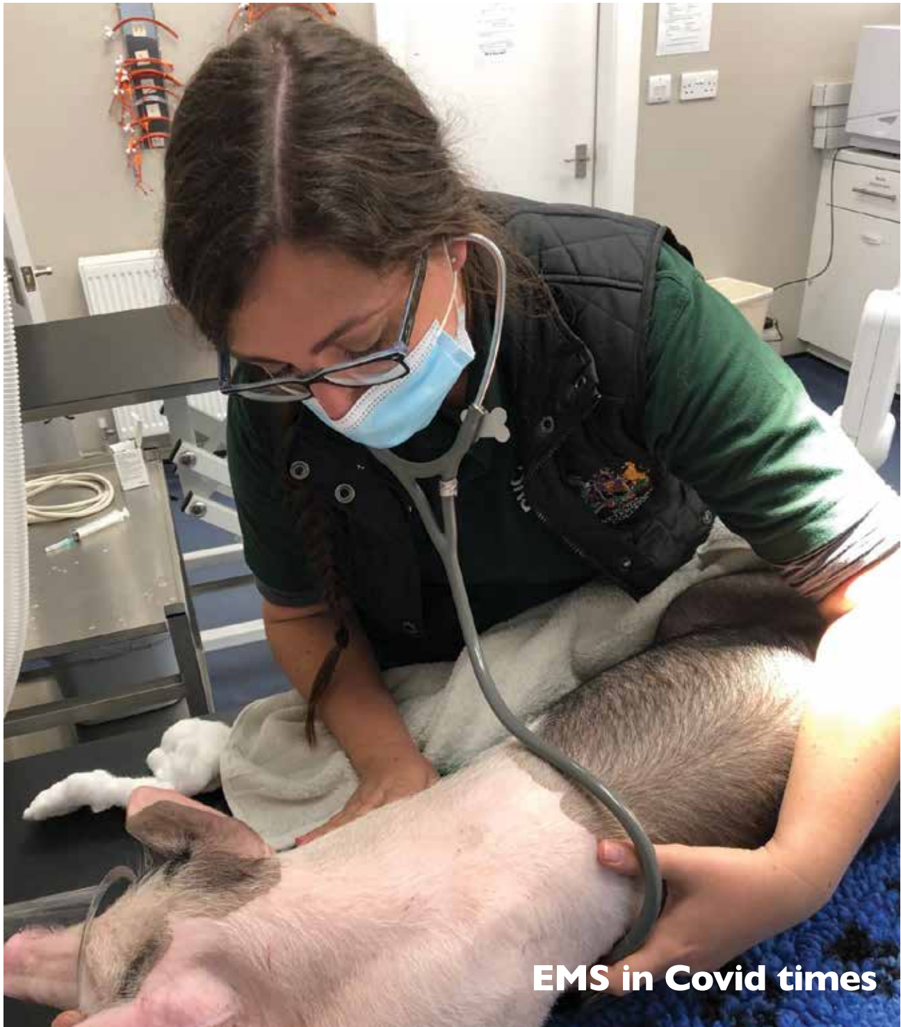
EMS in Covid times