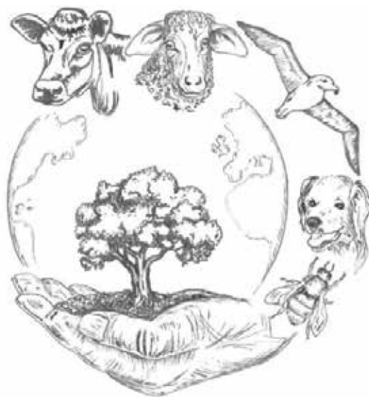
The Mining Diamonds conference logo

The VPHA-AGV 2020 virtual conference week format was, as far as we are aware, one of the first of its kind. We were able to explore new educational platforms, maxim-