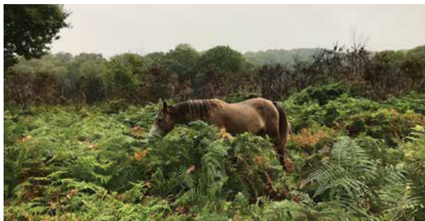
A New Forest pony in Sway just opposite a yard I visited

Unfortunately, the house in the New Forest wasn't quite liveable in time for my second stint of EMS so I began my first week in the New Forest commuting from the Isle of Wight. This involved getting a lift to the ferry, taking the ferry, getting a train from the ferry to my car, and then driving to the surgery. It drained me massively and I felt that I wasn't my best self on placement. I was also a bit deflated as the practice was cancelling a lot of