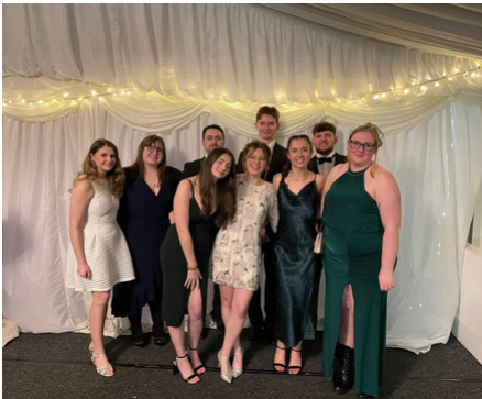
UCLan at AVS Congress 2024

The staff here at UCLan are absolutely fantastic. We have a range of incredible vets and vet nurses. We are also assigned both a personal tutor and a personal coach. Our tutor is there mainly for the academic side of things, whereas our coaches are there for everything else, whether that be wellbeing, what you get up to outside of uni and generally to see how we are coping with everything. The UCLan Vet School staff are huge on mental health, and are so welcoming and more than happy to listen to any concerns, and point you in the right direction if need be.