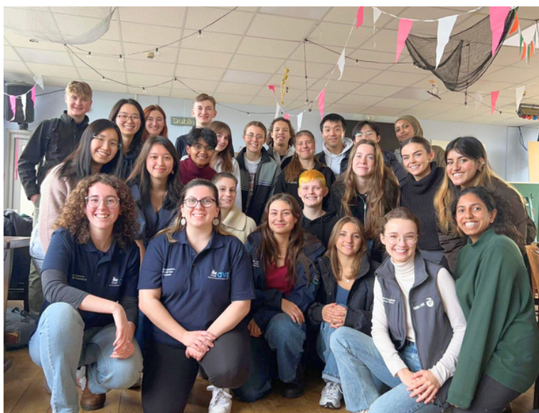
IVSA Meeting in Bristol in 2023